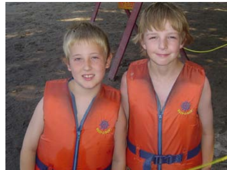
Kids growing? Cleaning up the cottage? Medium-size life jackets / PFDs (40 – 80 lb. range) gratefully received as donations

Did you know that your donations of Canadian Tire money this summer resulted in us being able to purchase a tetherball and some additional canoe paddles? Let's keep it up!