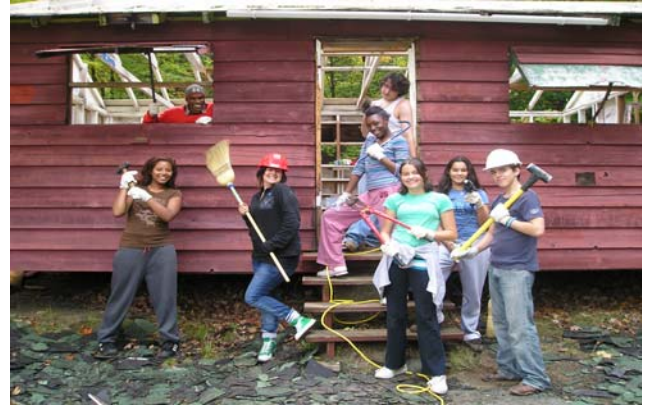
The youth group from Weston Park Baptist Church help to tear down the old Hiawatha cabin on September 23, 2006.

arrange to join in the work or to select your piece of Kwasind history.